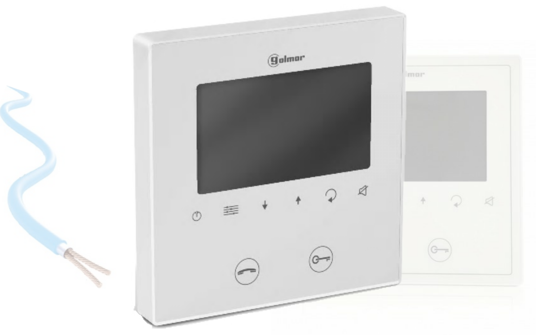
Vesta 2 hands free monitor with 2 wire "GB2" digital installation.

This hands free unit is powered with our exclusive two wire technology, "GB2", that has been specially designed for medium size projects that require amazing features.